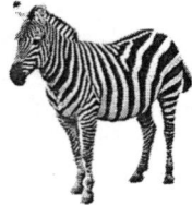
( b )