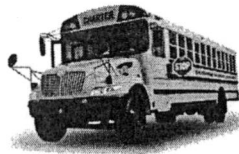
( c )